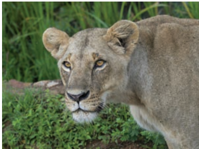
Top: A fisherman with his catch on the Bamingui River, Koukourou-Bamingui Basin, Central African Republic. Left: Lion (in the Sango language: Bamara)

In the Central African Republic (CAR), WCS focuses on protecting key species and habitats, while integrating local knowledge and fostering community involvement. These efforts seek to improve the well-being of people dependent on these ecosystems for their livelihoods. WCS supports local communities through livelihood programs, with a focus on sustainable natural resource management efforts to reduce conflicts between agriculturalists and pastoralists. WCS works with herders and farmers to minimize conflicts, preserve traditional routes, and protect fragile ecosystems.